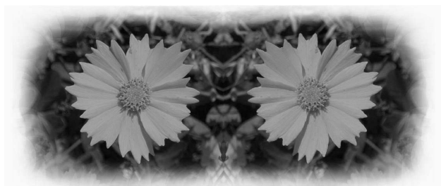
Figure 1. Stimulus material used in our experiment: (a) eyes for the social cue condition and (b) flowers for the neutral condition.

the distribution of the data and the quality of the GLM, the original GLM was conducted again. If we had ignored the premises needed for conducting an uncorrected GLM analysis, we would, indeed, have replicated Bateson et al.'s (2006) findings by showing a significant effect of Social Cue (eyes vs. flowers), F(1, 7) = 11.82, p = .011, \eta_p^2 = 0.628 – for purposes of direct comparison, the Bateson et al. analysis yields F(1, 7) = 11.55, p = .011 . However, when we corrected the statistics according to the violated premises (e.g., the inequality of variances), we obtained a nonsignificant result, F(2, 7) = 4.56, p = .054, ns .